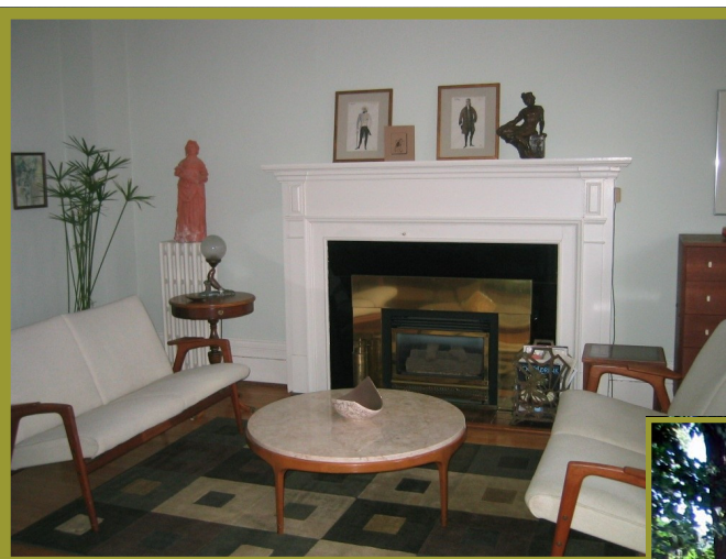
Main Floor Living Room

A fabulous owner-occupied duplex in one of Stratford's finest neighbourhoods. This unique investment opportunity awaits the discriminating buyer. This well-maintained home has two large units. Both units feature a sun porch and separate garden sitting areas, as well as separate 100 amp hydro services. Rents have not been set so there is opportunity to set your own.