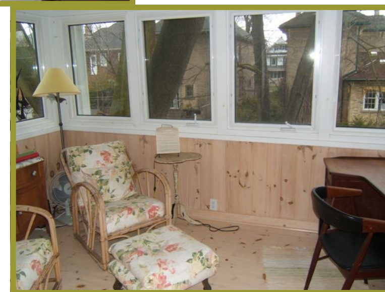
Upper Unit Sun Porch

Hide away in the back master suite. The upper unit features a private master with ensuite bath and sun-filled porch overlooking the back gardens.