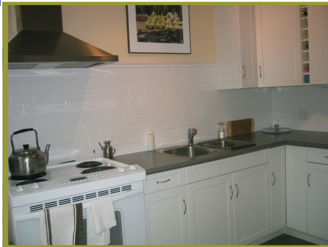
Fabulous Modern Kitchen