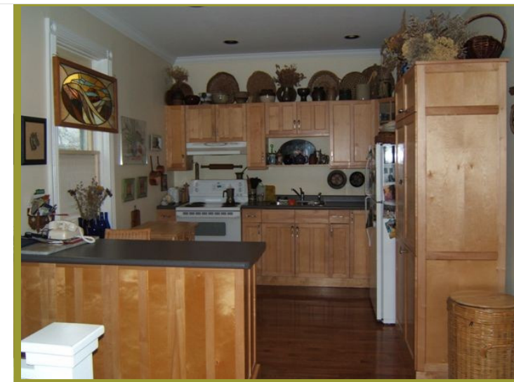
Upper Unit Kitchen

The large, two bedroom, two bathroom upper unit features open concept principal rooms, gas fireplace, central air conditioning and functional, well-renovated kitchen.