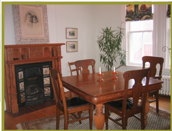
Large Formal Dining with Original Fireplace

A fabulous owner-occupied duplex in one of Stratford's finest neighbourhoods. This unique investment opportunity awaits the discriminating buyer. This well-maintained home has two large units. Both units feature a sun porch and separate garden sitting areas, as well as separate 100 amp hydro services. Rents have not been set so there is opportunity to set your own.